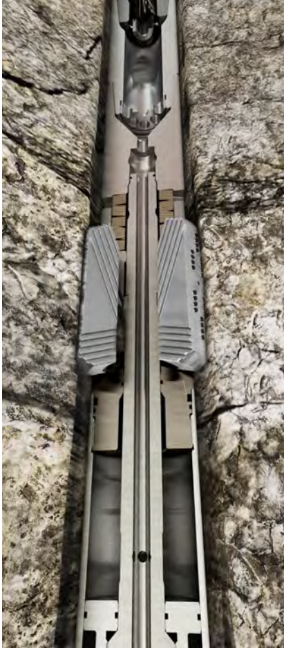
Triaxial expandable anchor.

With the TrackMaster OH-C system, setting the whipstock and cementing are accomplished in a single trip, saving the costs of extra trips, additional cement plugs, loss of drilling days, and reconfiguration of the drilling trajectory.