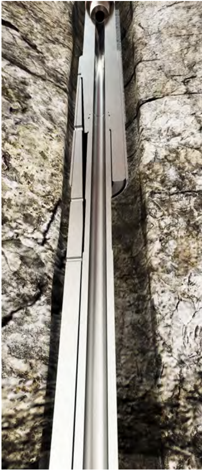
Running tool assembly.