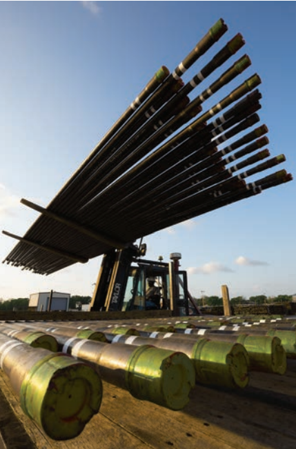
Tubing is being loaded for shipment from the Thomas Tools facility.