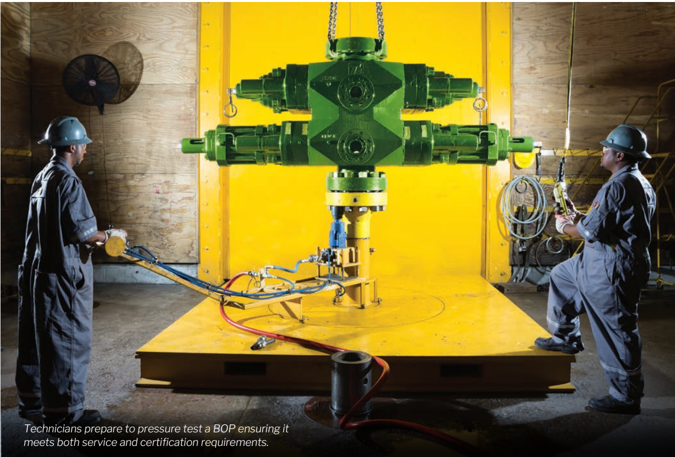
Technicians prepare to pressure test a BOP ensuring it meets both service and certification requirements.