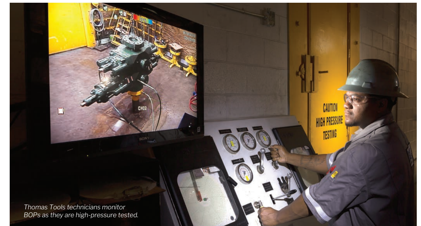
Thomas Tools technicians monitor BOPs as they are high-pressure tested.

Continued innovation resulted in the “Thomas Tools Feature,” which increases the torsional strength of high-torque connections. We were also instrumental in helping develop the first high-torque, double-shoulder refacing tools.