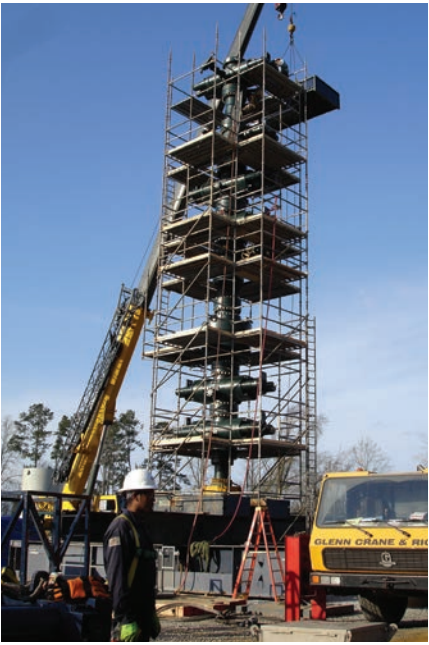
One of Thomas Tools' tallest snubbing stacks is shown—a rig-up of 21 1/4 in BOPs.