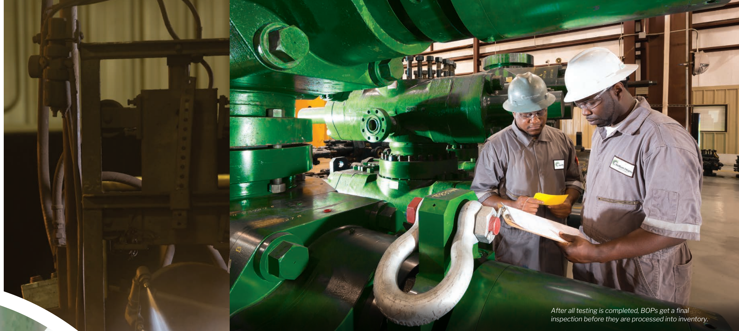
After all testing is completed, BOPs get a final inspection before they are processed into inventory.