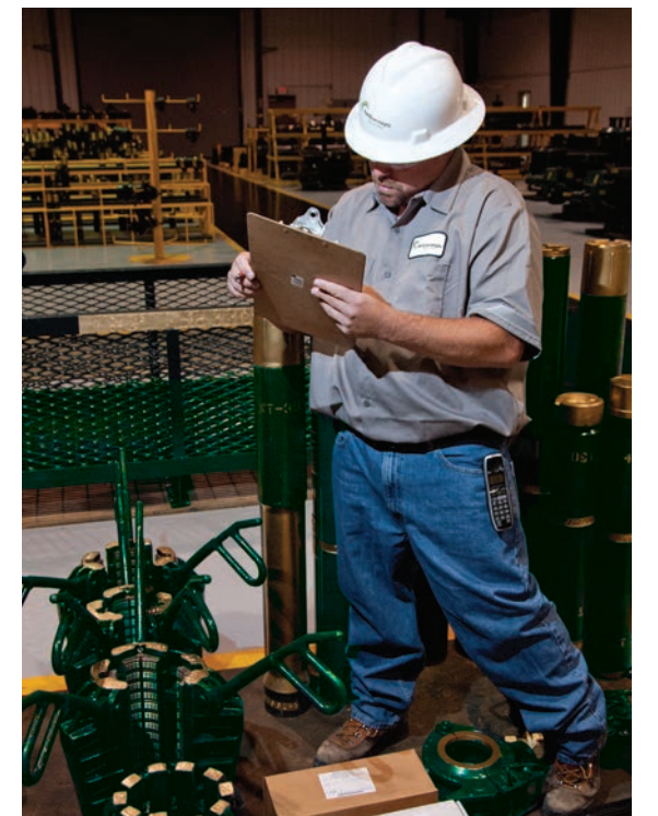
To ensure they meet Thomas Tools standards for quality and reliability, slips get a final inspection check by an experienced technician.

Our equipment, which is purchased only from world-class vendors, is thoroughly inspected to ensure the highest standards of quality and reliability. Our inspection procedures are widely recognized as some of the most stringent in the industry.