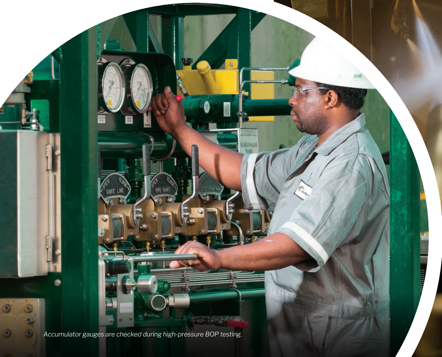
Accumulator gauges are checked during high-pressure BOP testing.