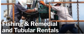
Fishing & Remedial and Tubular Rentals