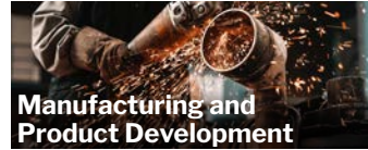
Manufacturing and Product Development