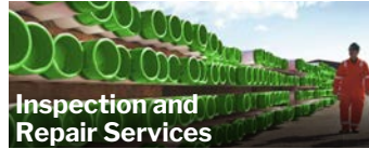
Inspection and Repair Services