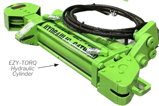
EZY-TORQ Hydraulic Cylinder