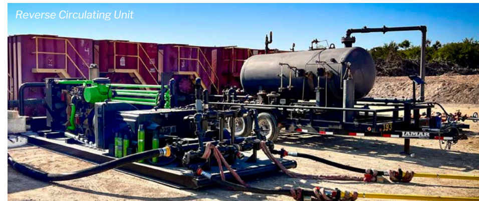
Reverse Circulating Unit

Our fleet of highly capable operators and equipment packages can be deployed for workovers, maintenance, and recompletion services.