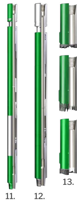
11. TMC Single-Acting Hydraulic Fishing Jar 12. TMC Bumper Sub 13. Washover Shoes